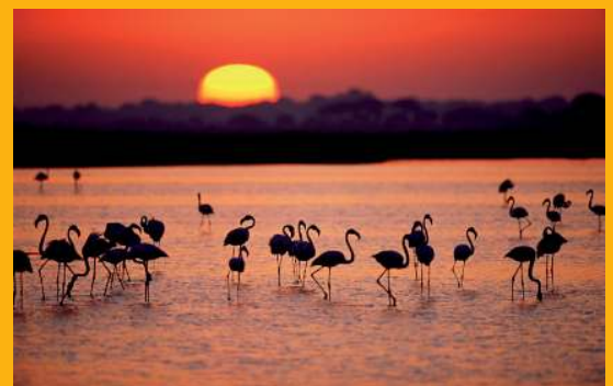
Doñana Biological Reserve

At the start of 2005, numerous scientific networks gathered in Amsterdam to propose a joint European research infrastructure on biodiversity, a project that was only possible through international